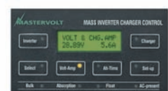
Remote panel, model Masterlink/MICC (optional).